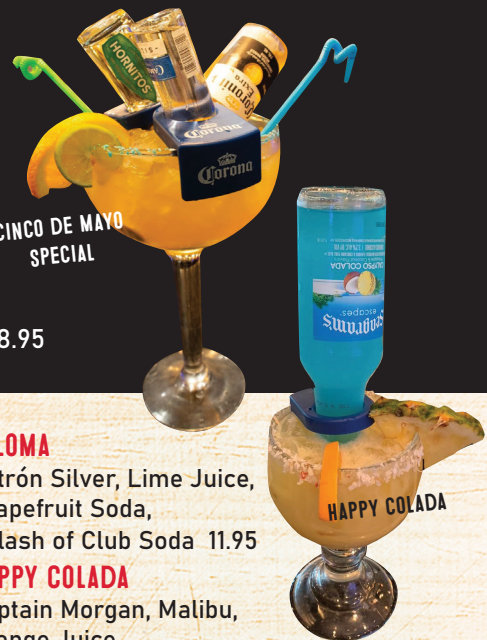
CINCO DE MAYO SPECIAL

38 oz Premium Margarita with two mini Tequila Bottles and Coronita Beer 25.95 Frozen or On-The-Rocks